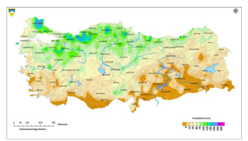
Figure 1: Areal precipitation during June 2020

Turkey received 39.5 mm of precipitation during June 2020, which is 28.2% above the 1981-2010 averages (30.8 mm). June precipitation during the last seven years has been above the long-term averages consecutively. The wettest June on records was observed in 2015 with 56.7 mm of precipitation. Marmara and Black-Sea regions experienced unusually wet conditions in this June, which led local flooding in some locations. Marmara Region received precipitation almost twice its long-term average for the month, with the peak observed in Kırklareli province as 139 mm. It was followed by Düzce (137.9 mm) and Zonguldak (109.5 mm) provinces. Considering the major cities of Turkey, amount of total precipitation in June in Istanbul and Izmir were noted with more than 100% increase as compared to their normals while Ankara recorded 66.4% increase above its normal. On the other hand, below-average precipitation was observed across the Mediterranean, Eastern Anatolia and South-eastern Anatolia Regions during June 2020. In South-eastern Anatolia, the average rainfall in June was only 3.8 mm, which is 56.8% less than its normal. Kilis province received the lowest amount of precipitation with 1.1 mm, followed by Gaziantep (2.9 mm), Mardin (3.1 mm) and Sanliurfa (3.1 m) provinces. June areal precipitation and its comparison with long-term averages (1981-2010) are shown in the figures below (Figure 1 and Figure 2).