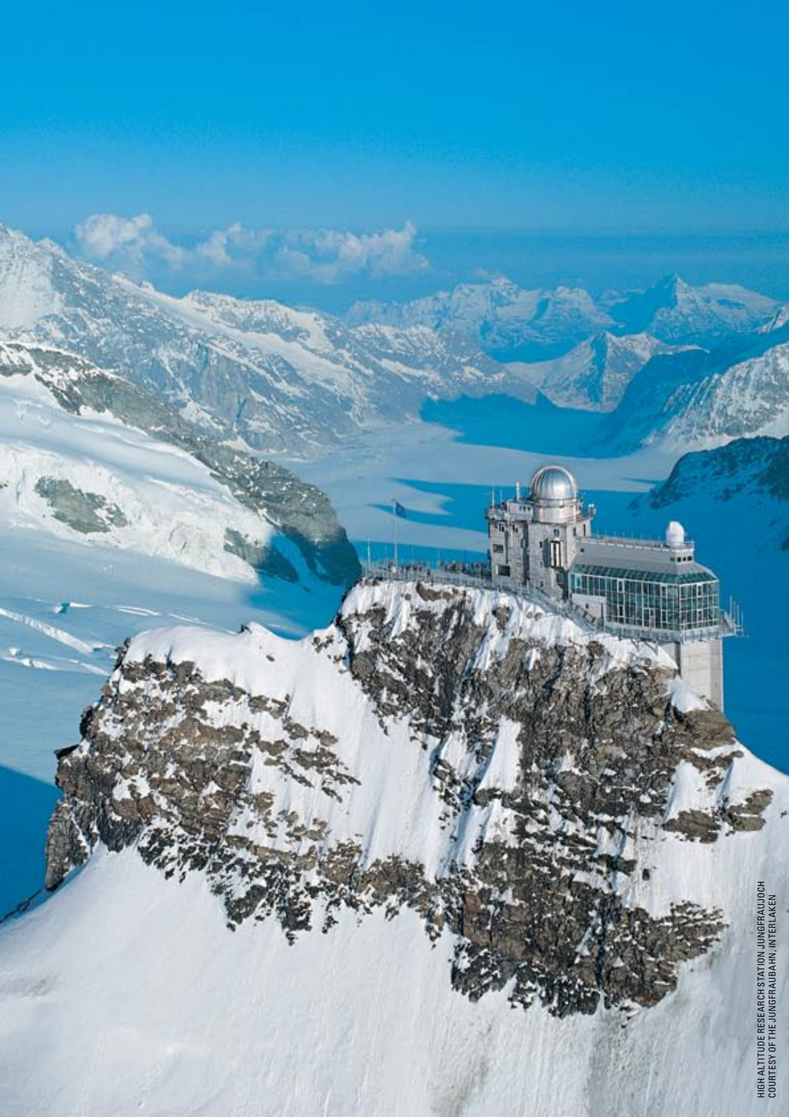
HIGH ALTITUDE RESEARCH STATION JUNGFRAUJOCH