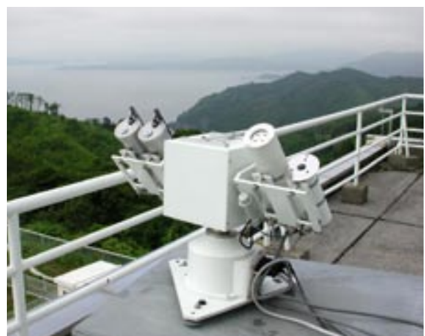
A sun-tracking aerosol photometer at GAW station Ryori, Japan, measures total atmospheric aerosol burden.

Virtually no place on the planet is far from an observation system designed to collect specific information about the air we breathe. On a clear evening, a satellite may be spotted, transmitting data back to Earth about a wildfire. On a clear day, a commercial or research aircraft or balloon may be spied, measuring the air quality. By the ocean, a ship on the horizon might be sampling