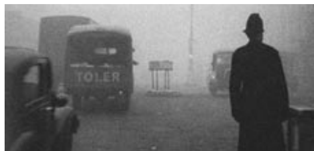
An early impetus for action was the Great Smog of London in December 1952.

The Olympic Games bring the world’s best athletes together. In the past decade, they have also provided a beneficial side-effect: pioneering measures to improve air pollution during the Games and to increase awareness of air-quality issues. For the 1996 Olympics in Atlanta, Georgia, USA, the city